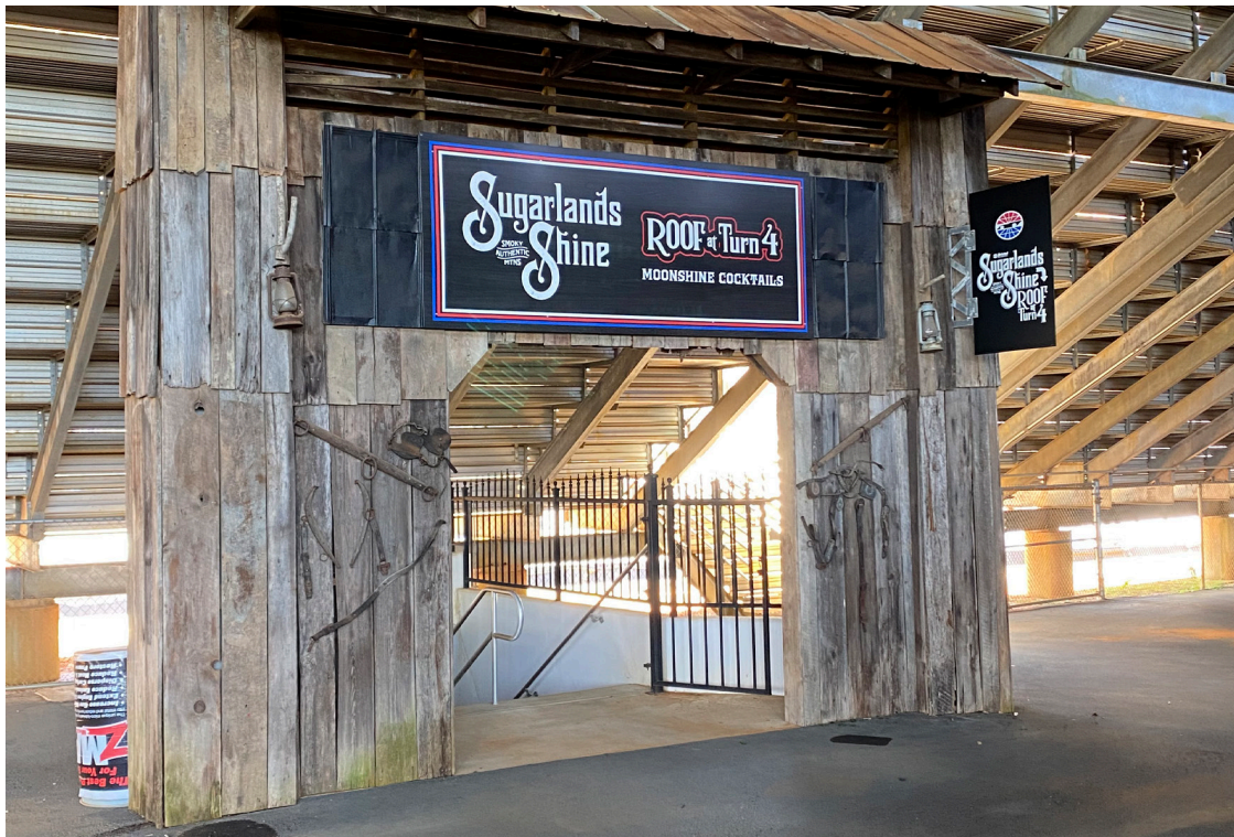
Access from ground level at Waltrip Grandstand, Section G-H and inside of Gate 13