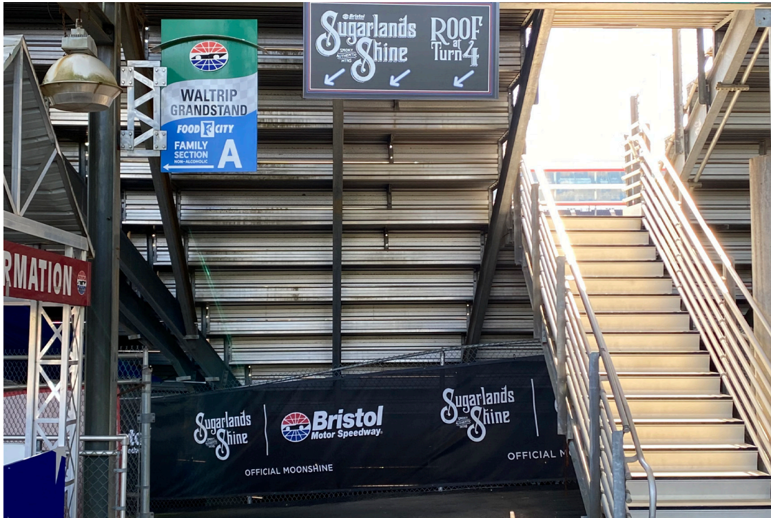
Access from the concourse at Waltrip Grandstand, Section A and inside of Gate 14/Elevator Tower H